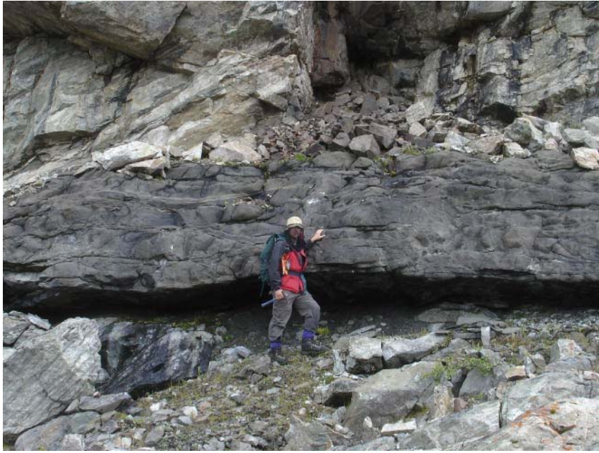
Fig. 2. Kimberlite sill of approximately 3.5 m thickness intruded within pre-Ketilidian gneiss and cross-cutting a vertical Gardar age ( c. 1200 Ma) dolerite dyke. Located at Midternæs by the glacier Sioralik Bræ (see Fig. 1B).